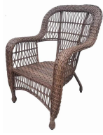
A 1PC Chair