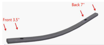
B 2PC Runner